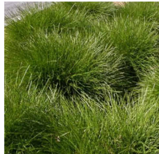
5 - LOMANDRA ECHIDNA