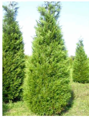
1 - THUJA PLICATA