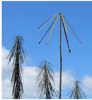
6 - PSEUDOPANAX CRASSIFOLIUS (LANCEWOOD)