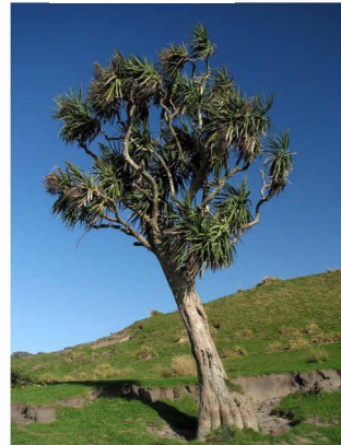
3 - CORDYLINAE AUSTRALIS (CABBAGE TREE)