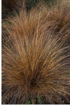
2 - CHIONOCHLOA RUBRA. RED TUSSOCK