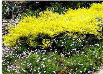
4 - COLEONEMA 'SUNSET GOLD' (BREATH OF HEAVEN)